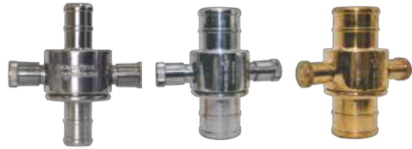
SDAC - 38 RT (Aluminium Coupling)